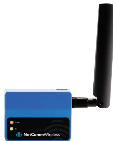
1 x NetComm Wireless NTC-3000 3G Serial Modem