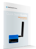
1 x Quick start guide